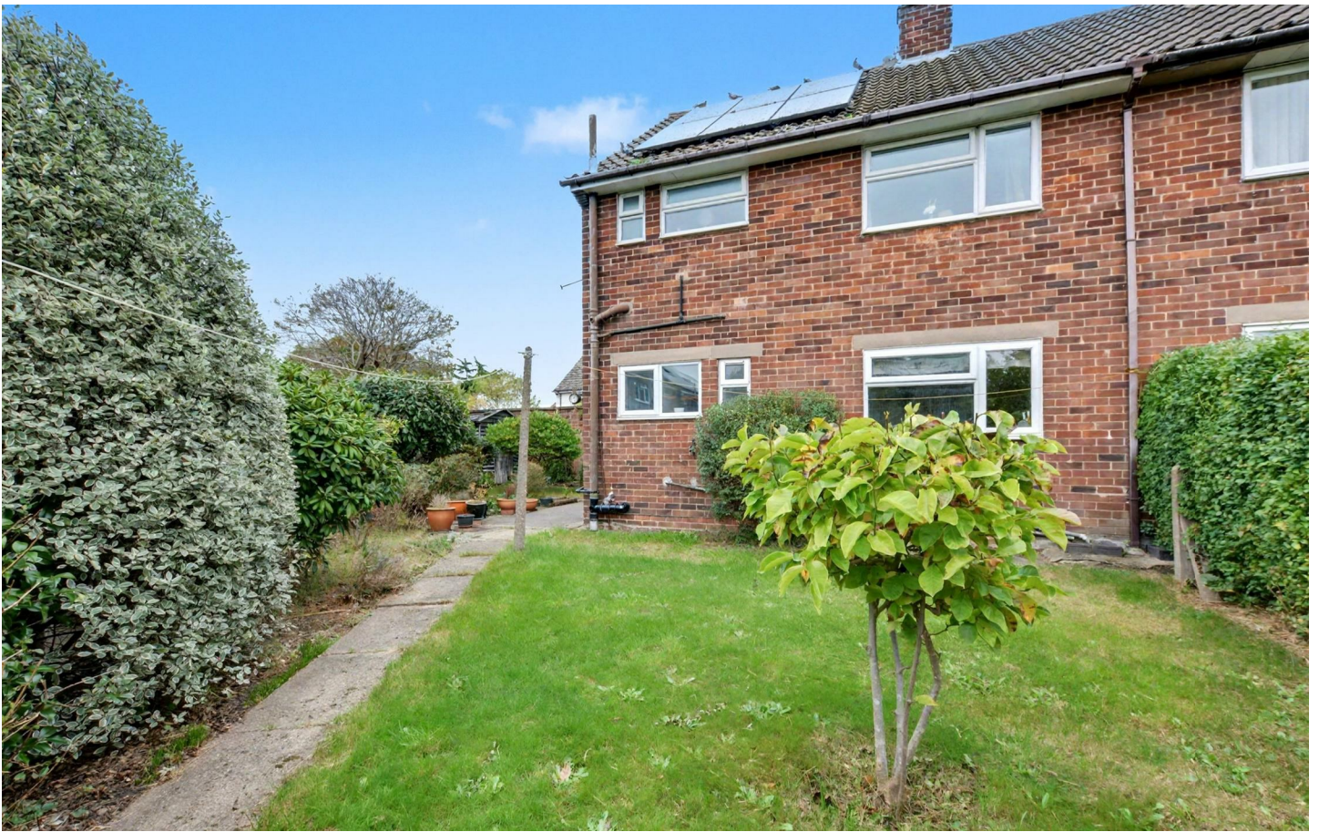
A THREE BEDROOM SEMI DETACHED HOUSE FOUND ON A CORNER PLOT.

Robert Ellis are delighted to offer to the market a semi detached home, occupying a corner plot on Baslow Close situated in Sawley. The property is built of brick construction and offers no onward chain.. There are three bedrooms on offer within this semi detached home with a lounge, kitchen diner, utility and downstairs WC set on the ground floor. The property stands well from the front aspect with a large frontage space which offers a good sized lawned area and off road parking. Being sold with vacant possession, this is a property that is recommended to view to avoid disappointment.